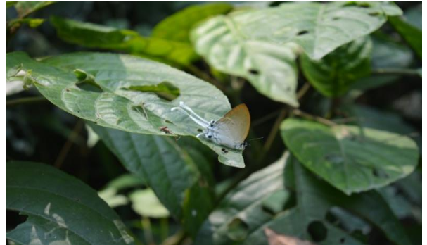
Cheritra freja (Lycaenidae)