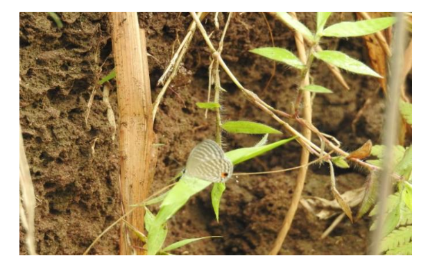
Jamides celeno (Lycaenidae)