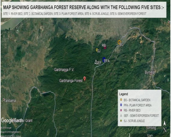
Fig: Map of Assam state showing the study area (a)the five habitat types- BG- Botanical garden, RBriver bed, PFA- plain forest area, SJ- scrub jungle, SEF- semi-evergreen forest, (Satellite view map). Survey Method

The study was carried out from June 2017, May 2018. Survey was conducted in the part of