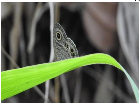
Ypthima baldus (Nymphalidae)