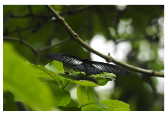
Papilios protenor (Papilionidae)