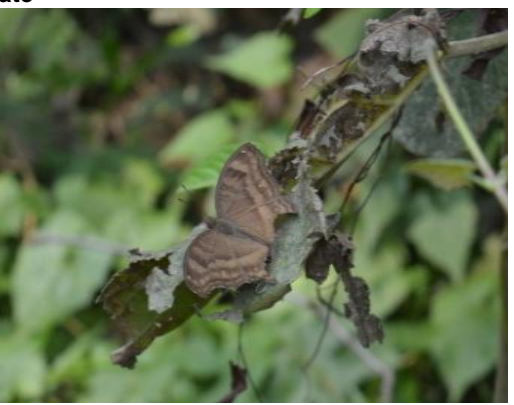
Precis iphita (Nymphalidae)