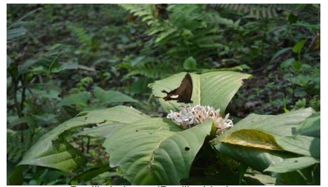
Papilio helenus (Papilionidae)